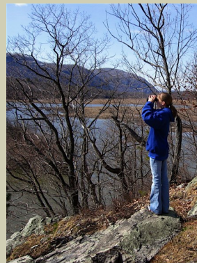
Overlook from the trail

Take a spring hike through the woods and listen to migratory songbirds and the rushing waters of Indian Brook .