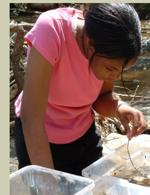
Searching for macroinvertebrates

Our education and interpretation programs are suitable for visiting schools, groups and the public. Program topics focus on conservation, the Hudson River Estuary, and birds and wildlife.